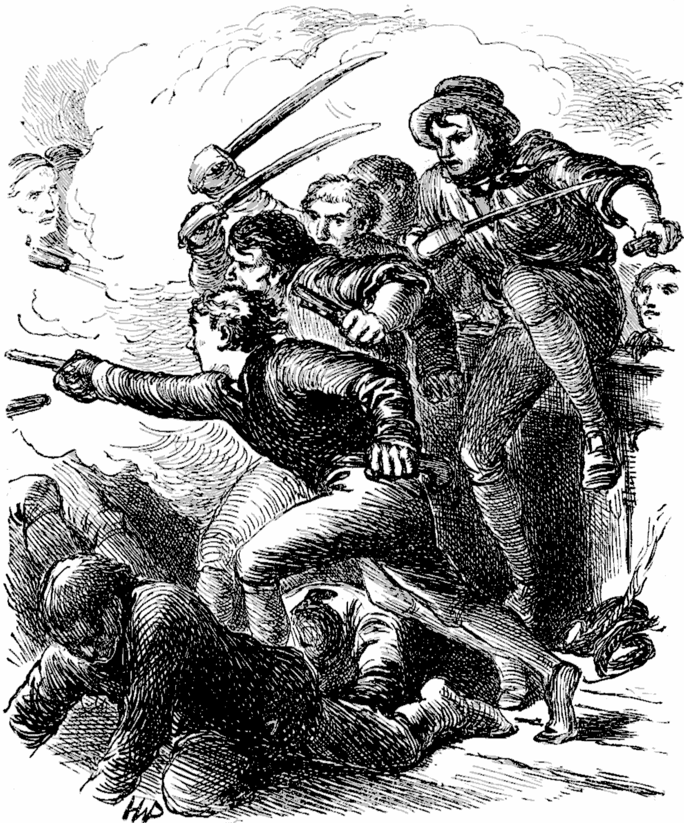
HARRY AND BEN BOARDING THE FRENCH BRIG.